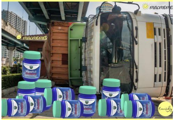
amazingly there was no congestion for eight hours